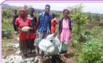
Students harvesting cabbage for their kitchen