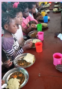
Sunday school children enjoying their meal