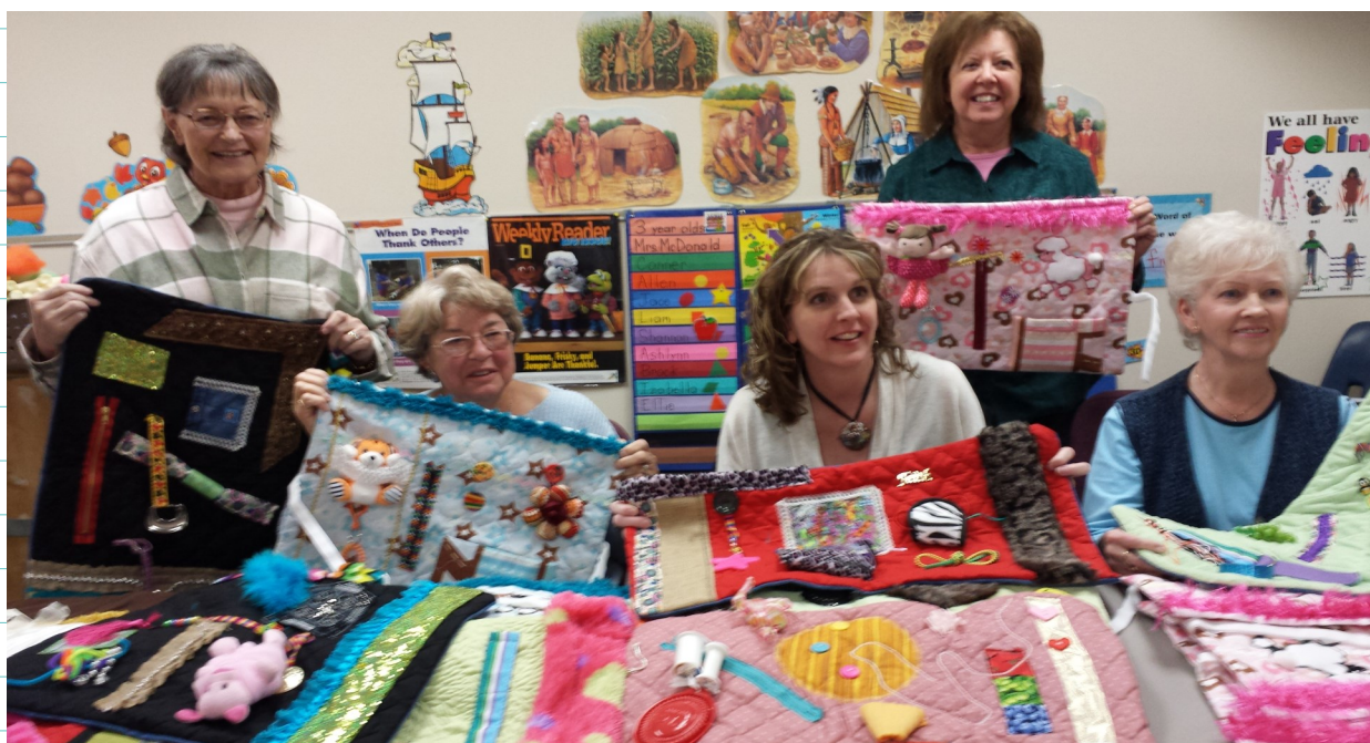
2014, UMW members create "Fidget Blankets" for Elms Haven Nursing Home.

We have not had Saturday meetings since the pandemic "Stay and Home" order, but we will have an online meeting on August 15 from 10 am until noon. Please join our group! Watch for the link to that meeting in the eblast.